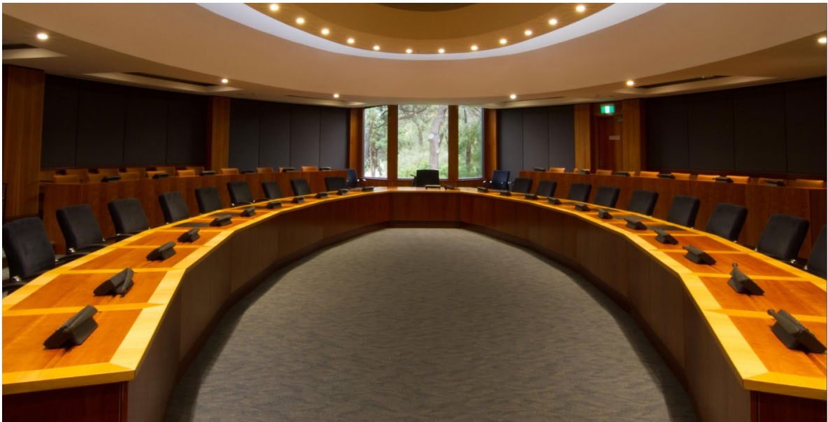
Council Chambers Building 100, Level 3

Committees that require further circulation of minutes to sub-committees, advisory groups or working parties will have a secure Committee site, with access provided to key staff to enable communication flow as required.